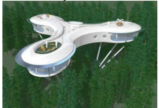
Unique Tree Houses

217 Palos Verdes Blvd. #250 Redondo Beach, Ca 90277