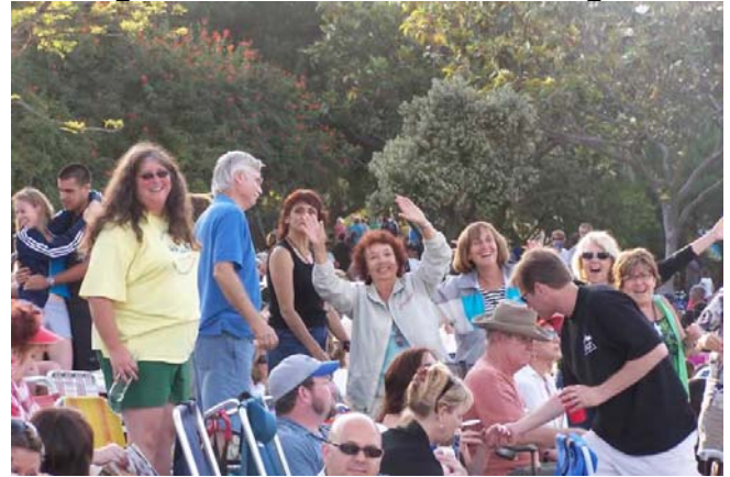
Fun Club Members having fun with the Eagles Tribute Band at Polliwog Park